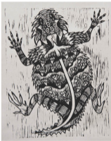
Good With Bad! Thomas Thomas, OFAI 2009

October 21 - 24, 2010 SCHEDULE OF EVENTS • faculty bios Maps & information