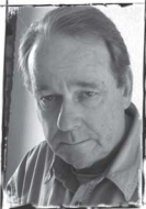
Sarkeys Foundation Faculty Chair