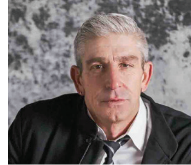
Richard Blanco Guest Artist Miami, Florida and Bethel, Maine